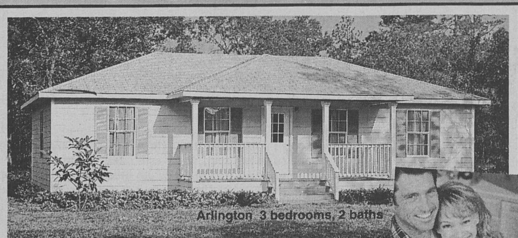
Arlington 3 bedrooms, 2 baths

Get into it! Save $$$ getting into doing some work yourself.